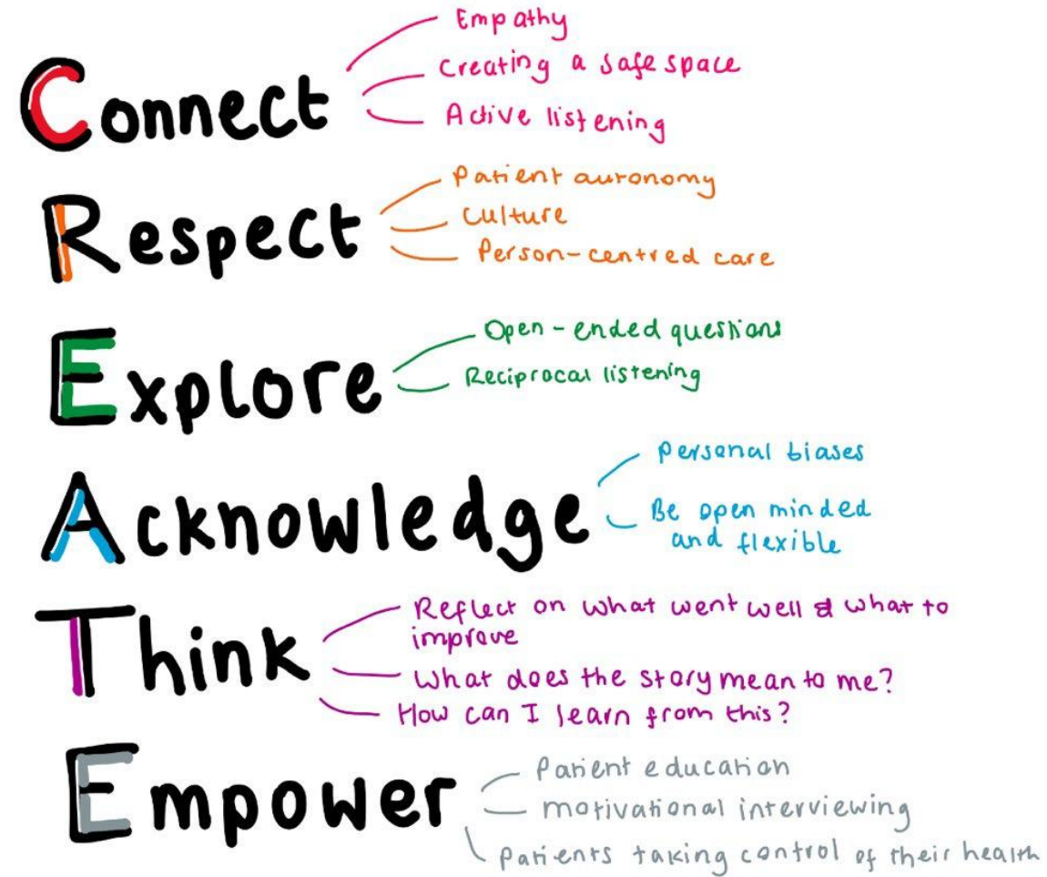
Figure 1: A visual aid to remember the CREATE mnemonic for working with patient stories.